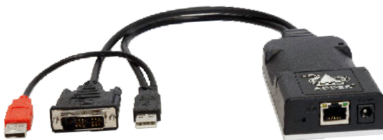
ADDERLink INFINITY 101T - DVI