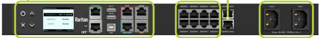
Model Shown: SRC-0800

Utilize these ports to connect two Remote Hubs, providing access to 8 additional sensor ports. Each hub and its connected sensors can be located up to 150 ft (50m) away from the device, expanding coverage to where you need it.